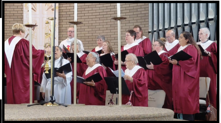
Genesis Chimes Music Sunday was on May 10th