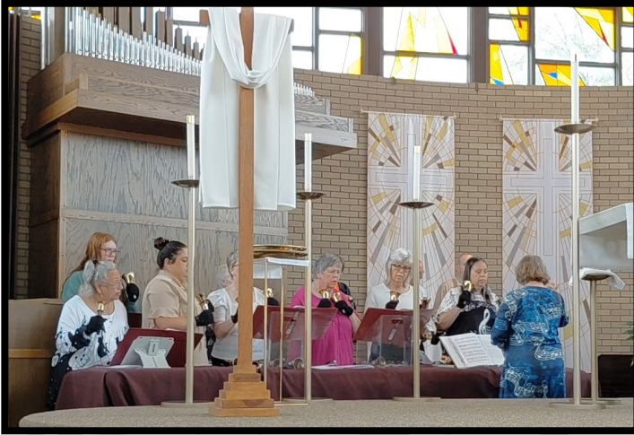
JuBellation Music Sunday was on April 26th